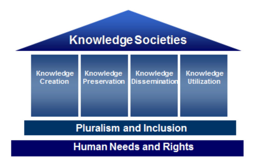
TABLE 2 - KNOWLEDGE SOCIETY PILLARS

The United Nations Educational, Scientific and Cultural Organization (UNESCO) took an early lead in including information and communication technologies in its mission to promote education, science and culture in the world. UNESCO started focusing on "building inclusive knowledge societies through information and communication" as a tool of empowerment for the world population.